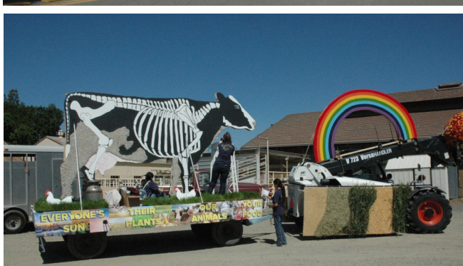
- Dr. Hovey with students and department Picnic Day float -